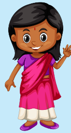
Meryem Pakistan / Pakistani