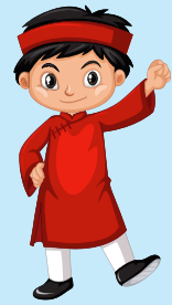
Omar Iran / Iranian