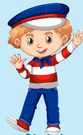
Dimitria Russia / Russian